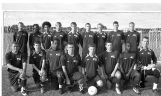
Dunstable College 1 st Team